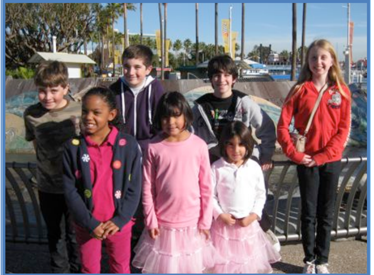
The author, front left, with some of her new friends at the aquarium.