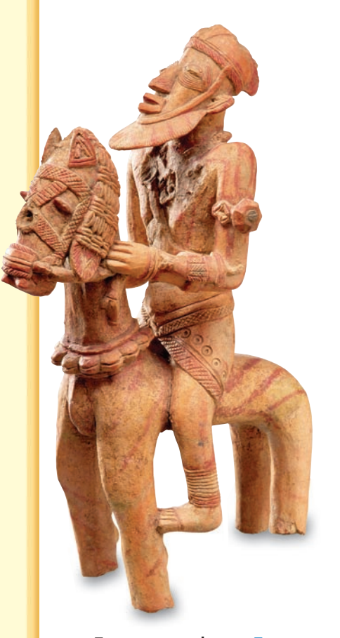
▲ Terracotta sculpture Terracotta is the type of clay used to make this sculpture. This sculpture was made around the 14th century in Mali, West Africa.